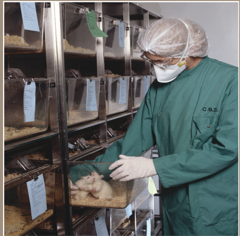
ABOVE: Animal technician assessing the health of rats used in studies of the parasite Trichinella.

Every breeder, supplier and scientific procedure establishment must have an animal welfare and ethical review body (AWERB), which replaces the ethical review process (ERP). The AWERB should advise the establishment licence holder, support the named persons and licensees on animal welfare and ethical issues, and develop the widest possible application of the 3Rs.