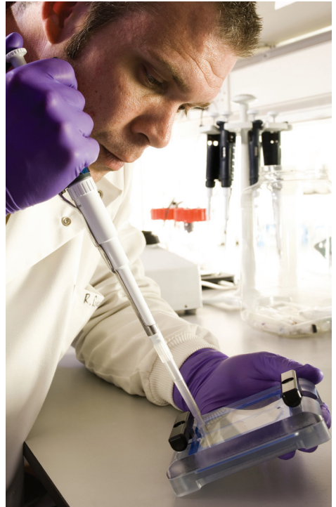
ABOVE: Scientist preparing DNA samples prior to sequencing.

Support for any project involving regulated procedures under the ASPA is on the absolute condition that no work can commence until the licence authorisations required under that Act have been granted and that it will be terminated if any such authorisations are subsequently withdrawn.