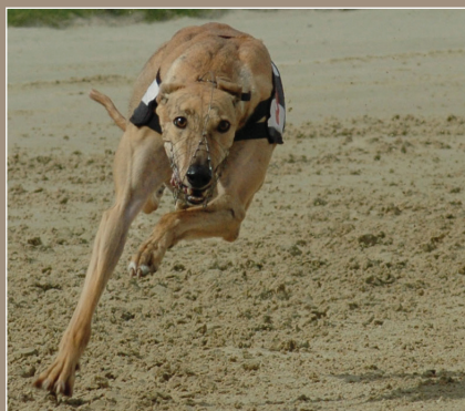
ABOVE: Sprinting greyhound used in biomechanics research.

Questions on compliance with the Guidelines may be asked of the applicant, ethics committee or named persons on licences issued under the ASPA, as part of the peer review process for research proposals. The NC3Rs may be asked by the funding bodies to give advice on compliance.