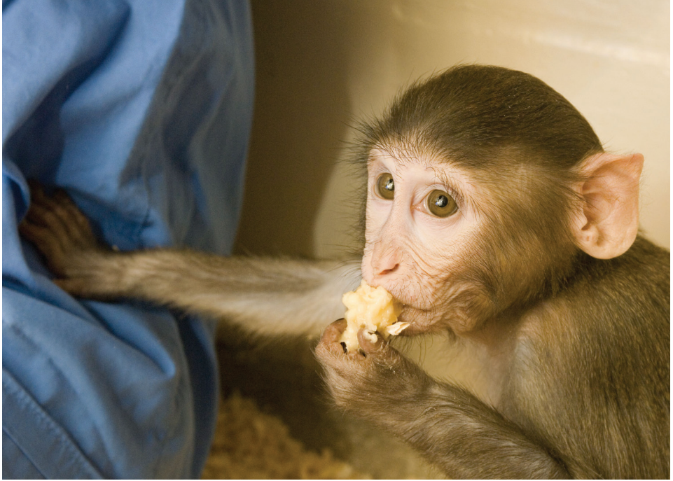
ABOVE: Young rhesus macaque socialising with an animal technician.