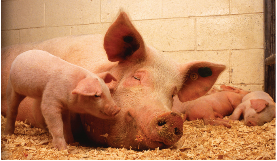
ABOVE: Pigs developed from cryopreserved and surgically implanted embryos. Agricultural Research Service