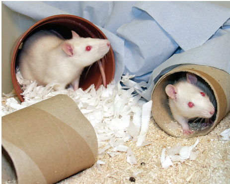
LEFT: Rats provided with substrate, nesting material and cardboard tubes. Institute of Animal Technology