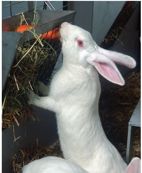
RIGHT: Group-housed rabbit in an enriched floor pen. Novo Nordisk

Sufficient time and resources should be allocated to allow regular review of all aspects of animal health and welfare (e.g. housing, environmental enrichment, handling and restraint).